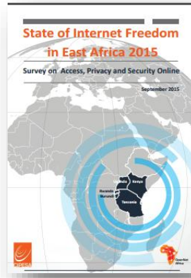
State of Internet Freedom in East Africa 2015