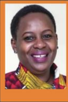
Hon. Neema Lugangira Member of Parliament Representing NGOs Tanzania National Assembly