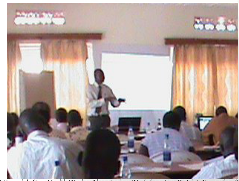
TI Uganda's Stop Health Worker Absenteeism Workshop, Lira District, November 2011

In Lira and Oyam districts, TI Uganda has empowered communities through ICT to report health worker absenteeism and poor service delivery. The Voluntary and Social Accountability Committees (VACs) set up in the two districts currently have 199 members and have so far made visits to eight health centres. So far, the project has seen a slight indication of improvements in health service delivery in the two districts. Based on arrival logs, health centre workers are recorded as reporting to work on time.