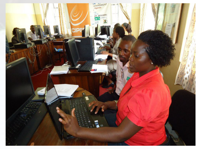
Kasese e-society collaborative workspace staff training, December 20011

Kasese e-Society Resource Centre staff have been trained in the use of a collaborative workspace that will be used to document the centre's activities related to the project. CIPESA has also conducted an analysis on how policies and practices by public agencies affect e-participation, and will use for an advocacy and awareness-raising campaign involving the media, legislators and civil society.